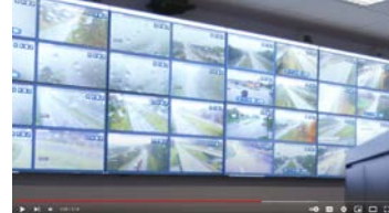
Traffic Operations Center/ Customer Service Center