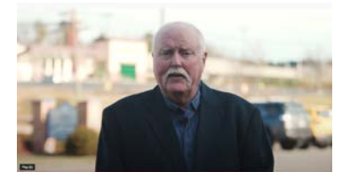
Bristol District Truck Climbing Lanes