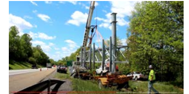
Digital Message Signs