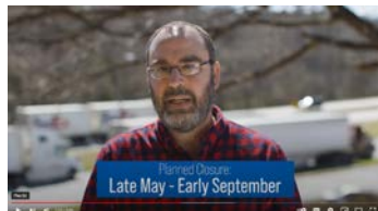
Troutville Rest Area Temporary Closure