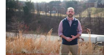
Exit 137 to Exit 141 Widening