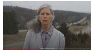
Staunton Area Widening