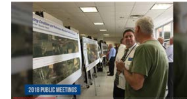
Picking the Projects