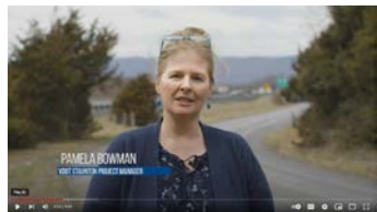
Strasburg Area Widening