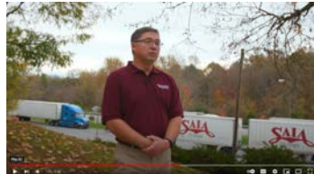
Troutville Rest Area