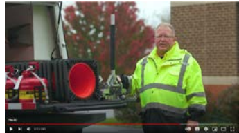
Safety Service Patrol