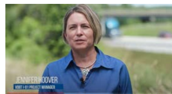
Staunton Area Auxiliary Lane