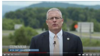
Wytheville Interchange Improvements